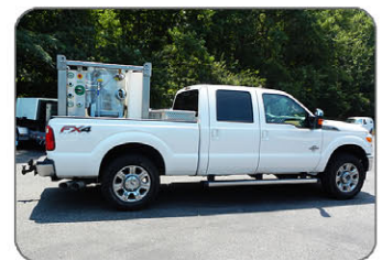
Compact enough to fit in a standard 6' pick up with tool box.