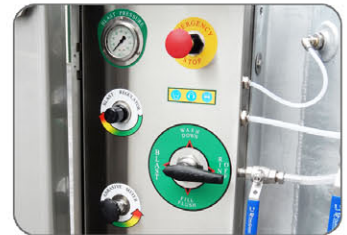
Patent pending engineered TRX Flow Dynamics