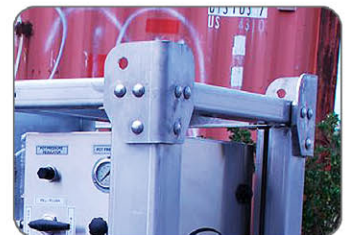
Heavy duty stainless steel frame, forklift/pallet jack pockets, 5x tested lifting eyes.