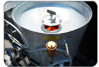
6.5-CF, hot-dipped galvanized, spring-sealed blast pot with auto vent.