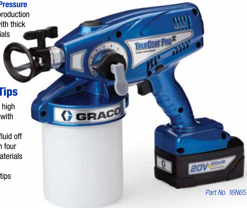
Part No. 16N657