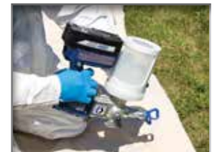
Attach cup with solvent, set to "Clean" and run upside down.