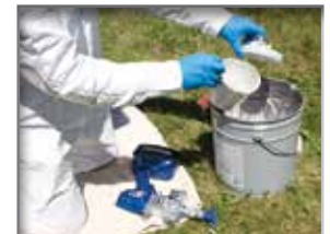
Dispose of cup liner and lid.