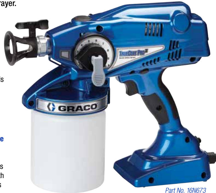
Part No. 16N673

High production rate with thick materials